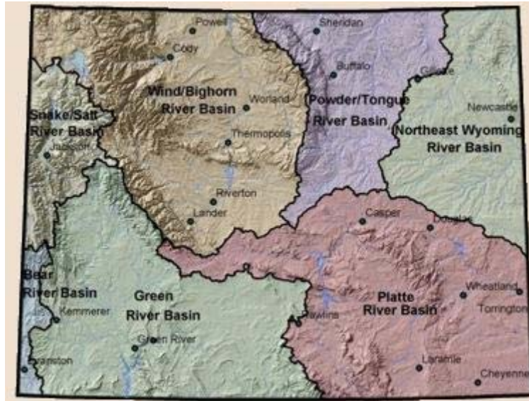
Figure 1. Wyoming's 7 Major River Basins